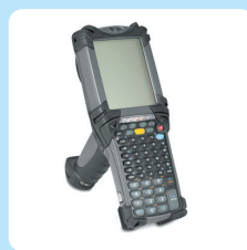
Data terminals & PDA